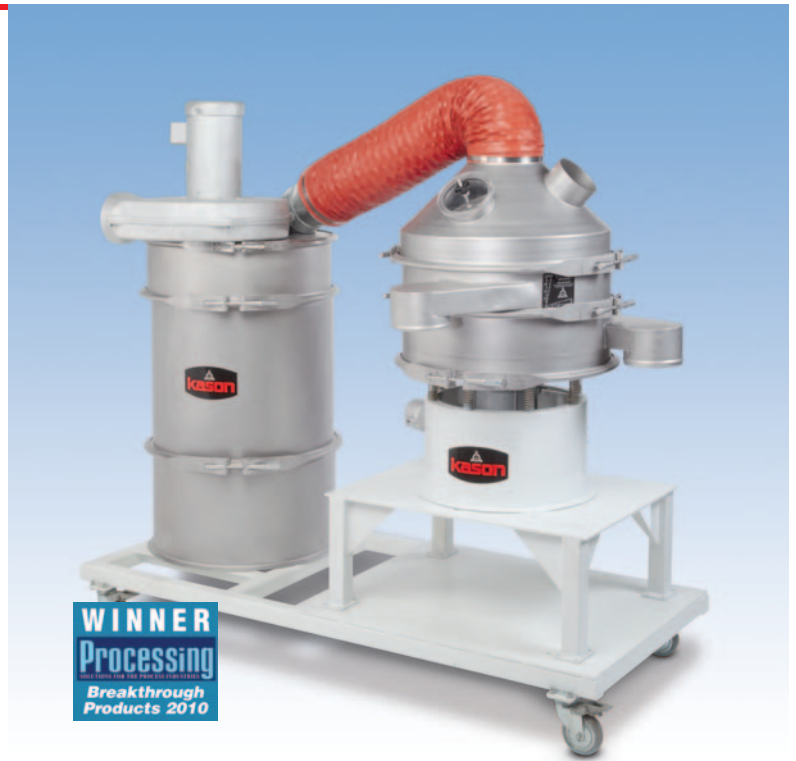
The VIBRO-AIR separator is available in 24 to 100 in. (610 to 2540 mm) diameters, in carbon steel or stainless steel, and is offered as a stand-alone unit or a complete system (shown) integrated with a dust collection system and exhaust fan (remote-mount control panel not shown) on a mobile frame, ready for connections to material infeed and discharge ports, and a power source.

The VIBRO-AIR separator can additionally scalp oversize particles from on-size material using an optional scalping deck fitted with a coarse screen mesh (not shown), positioned above the fine mesh screen.