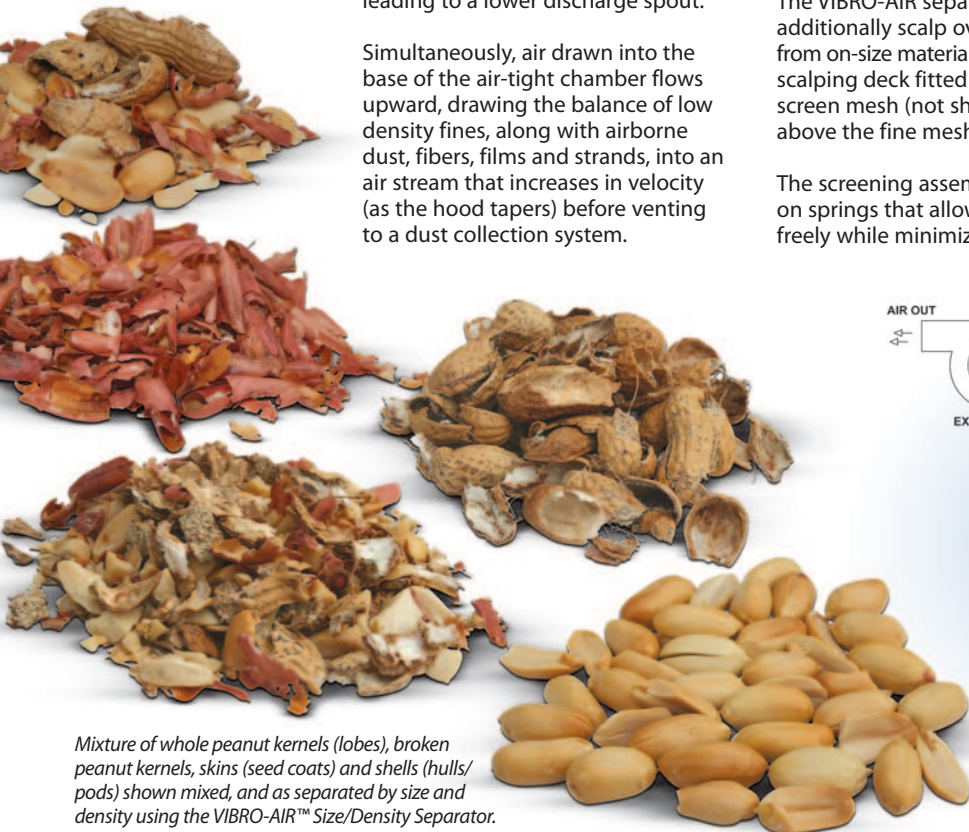
Mixture of whole peanut kernels (lobes), broken peanut kernels, skins (seed coats) and shells (hulls/pods) shown mixed, and as separated by size and density using the VIBRO-AIR™ Size/Density Separator.

Simultaneously, air drawn into the base of the air-tight chamber flows upward, drawing the balance of low density fines, along with airborne dust, fibers, films and strands, into an air stream that increases in velocity (as the hood tapers) before venting to a dust collection system.