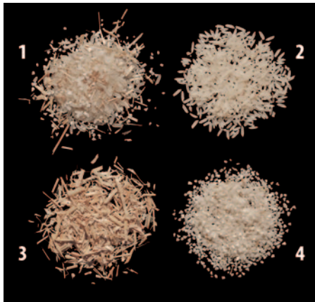
Rice: 1) mixture of on-size grains, undersize grains, and chaff, 2) on-size grains, 3) low bulk density chaff, and 4) undersize grains — as separated by screen vibration and airflow.

Vibrating internal trays and a screen mesh, together with airflow, separate fines and low-density materials from on-size products. Oversize particles can also be removed with an optional coarse screening deck positioned above the fine-mesh screen. Stand-alone units (shown) can be integrated into new or existing processes with connections to a power source, a bag house line, and material infeed and discharge ports.