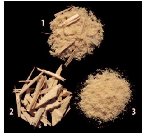
Wood: 1) mixture of undersize chips and powder, 2) on-size chips, and 3) low bulk density fines — as separated by screen vibration and airflow.