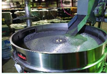
A view of the top of the separator and the feed chute from a different angle. The port through which large particles of ferrotitanium are removed is at the upper left.