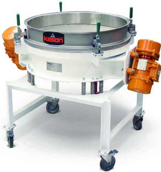
Kason's Quick Clean Low-Profile FLO-THRU Sifter features gap-free screen frames, quick-disconnect clamps, and a crevice-free interior, meeting cGMP, 3-A, USDA and FDA requirements.

MILLBURN, NJ—A new low-profile “FLO-THRU” sifter from Kason Corporation features a gap-free screen frame with quick-disconnect clamps and a crevice-free interior finished to cGMP, 3-A, USDA and FDA standards, allowing rapid, thorough washdown.