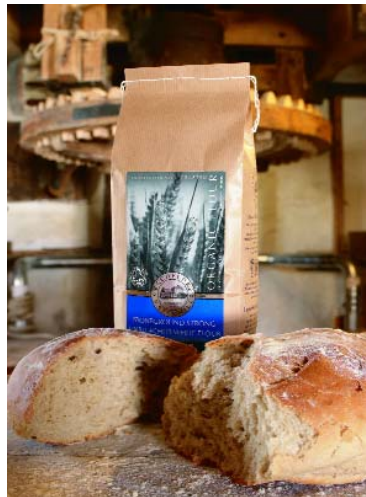
Some tasty samples of bread made from Bacheldre's Organic Stoneground Strong Unbleached White flour, a package of which is at the rear.

The Bacheldre mill uses two sizes of nylon screens: of 250-micron for white flour, and 550-micron for durum and brown flours. Screens are available for the CENTRI-SIFTER® screener in various other materials, including other types of monofilament cloth, woven wire in selected metals, perforated plate and wedge wire. Scott chose nylon because "we tried it and it worked well," says Scott.