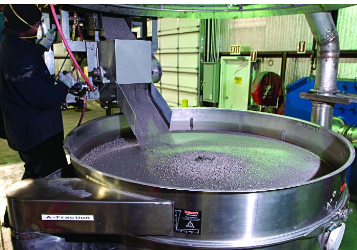
The granules slide down a chute onto the separator's coarse top screen. Smaller granules pass through the screen and larger ones migrate to the periphery and are removed through the port at left foreground.