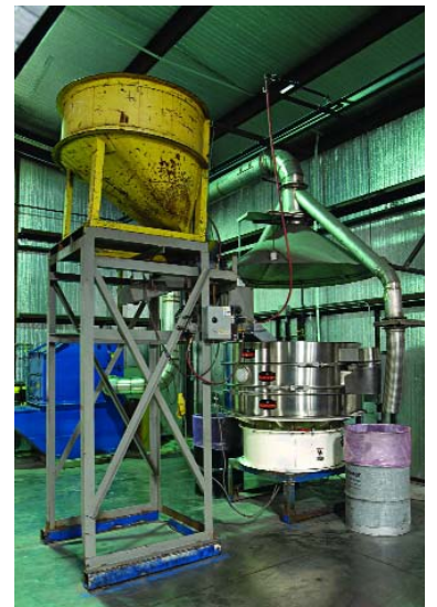
Ferrotitanium granules are fed from the yellow hopper to the stainless steel VIBROSCREEN® classifier, which uses successively finer horizontal screens to separate the metal into the desired size fractions.

Global uses an identical VIBROSCREEN® separator for screening sponge titanium, which the company receives from customers and vendors as mixed scrap that ranges from fines to rock-like chunks. This material is passed across a magnetic drum to remove ferrous metal, then crushed to the customer's requirement, which may range from 10 to 60-mesh. Fines are mixed with other material in the furnace and made into briquettes.