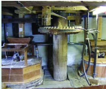
A view of the mill's main shaft, with its crown wheel, on the middle floor at the Bacheldre Watermill. The millstones, encased in wooden housings, are on either side of the shaft.

The mill was using two old, water-powered wooden dressers to separate the bran, but (as noted) one of those units has been replaced by the Kason machine, a Model KO CENTRI-SIFTER® screener. It is driven by a 2-hp motor and can process up to 1,540-lb (700-kilos/h) of flour. In contrast, the old dressers can each process only about 880-lb (400-kilos/day) in winter and 330-lb (150-kilos/day) in summer, when there is less water available. The capacity of each mill is 330 to 440-lb (150 to 200-kilos/h), depending on the type of flour produced.