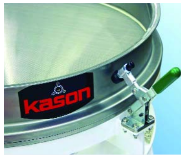
The screen frame's interlocking flange, secured by quick-disconnect clamps, fully envelops the support ring of the screen, allowing the wire mesh of the screen to fully extend to the interior walls of the frame, eliminating the gap that exists between the screen ring and frame wall of conventional screeners.

The sifter is offered in diameters of 24, 30, 40, 48 and 60-in. (610, 762, 1016, 1219 and 1524-mm). It can be equipped with either single or twin imbalanced-weight gyratory motors, and furnished with a dust-tight cover.