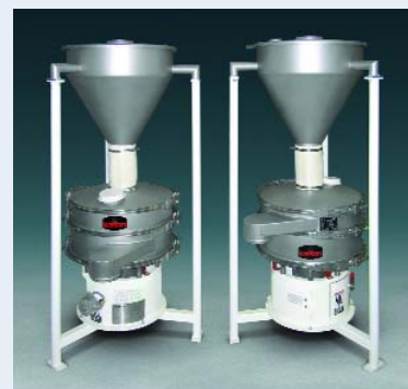
Integral feed control device of new Kason screener regulates the flow of incoming material, eliminating the need for separate feeders.

MILLBURN, NJ—A new Kason 3-in-1 System combines a VIBROSCREEN® vibratory screener, a batch hopper and an integral feed control device that regulates the flow of material into the screener. The system is intended for