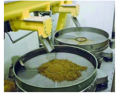
At 84-in. (2134-mm) in diameter, this Kason model K84-1-SS (foreground) is reportedly the largest circular screener made in Australia.